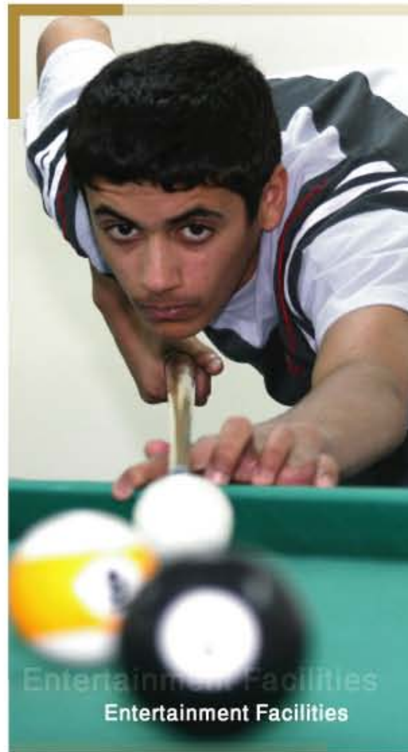
Entertainment Facilities Entertainment Facilities

Overseas cadets may stay during weekends. An additional weekend programme is offered for all overseas cadets.