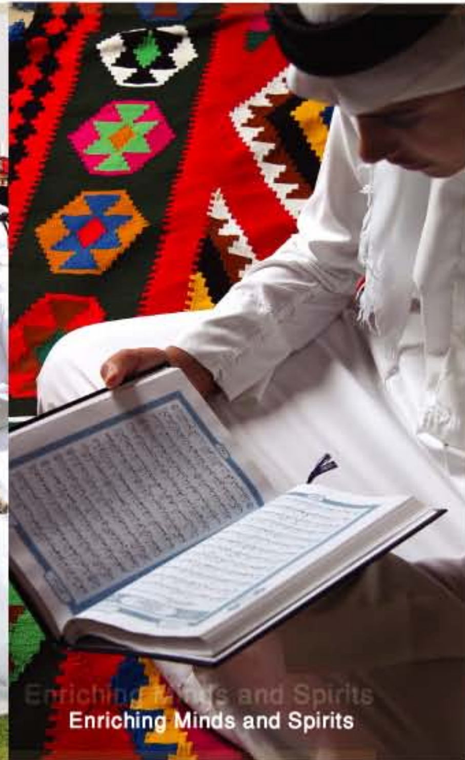
Enriching Minds and Spirits Enriching Minds and Spirits