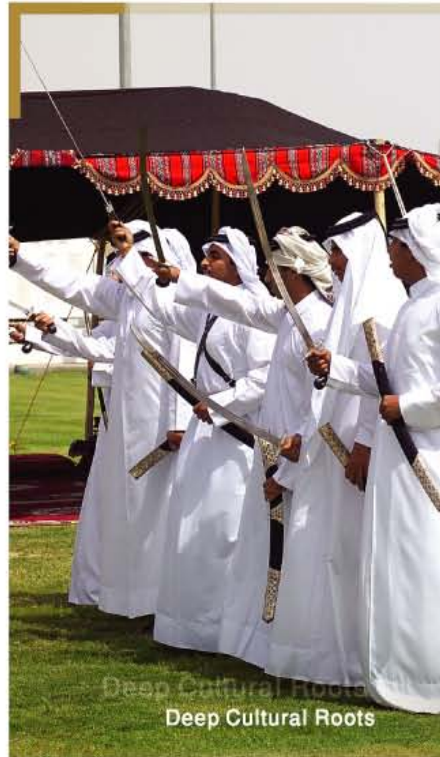
Deep Cultural Roots Deep Cultural Roots

There are two imams on campus and cadets are required to attend to daily prayers. Islamic Counsellors and imams are available for spiritual guidance and counselling.